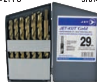
570143 - 29 PC Reduced Shank

Three ground flats eliminate chuck slippage