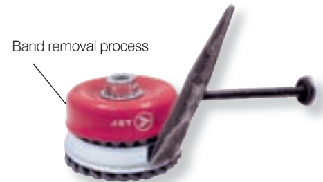
Band removal process