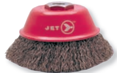
CC520T – A JET Exclusive!