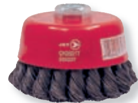
3-1/2" – A JET Exclusive!